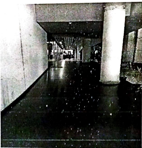
Spacious corridors are provided for easy moving .