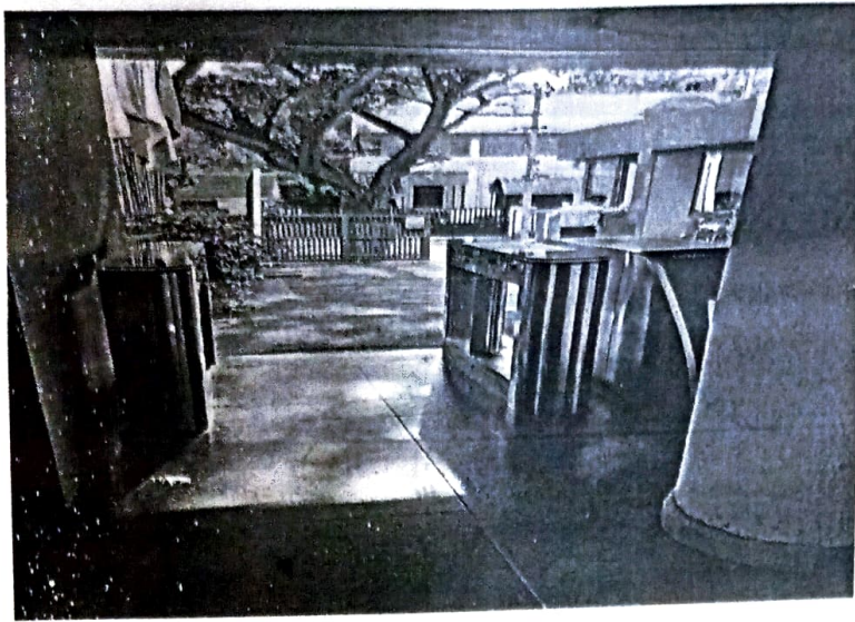
ISBR Business School features a 900 mm entrance pathway to ensure smooth accessibility for individuals using wheelchairs.