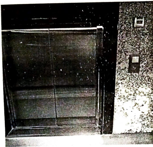
Lift is provided alternative to stairs, students and faculty use